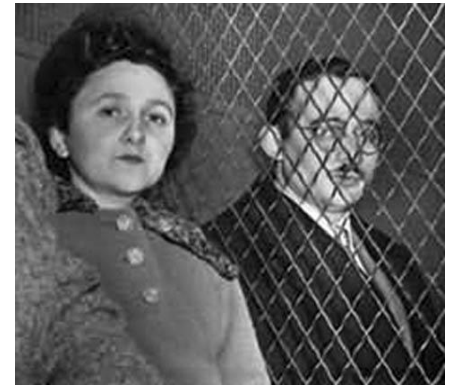
Ethel and Julius Rosenberg after being arrested.