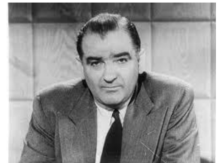
Senator Joseph McCarthy appearing on television.